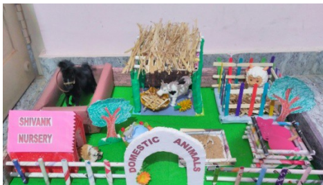
Houses of Domestic Animal