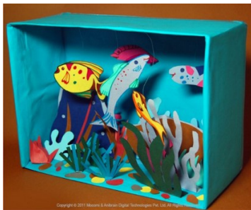
Aquarium with Shoe box