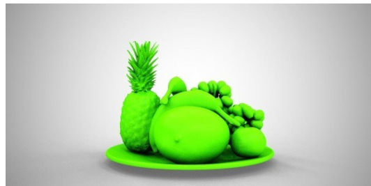
Basket of artificial Green fruits and vegetables