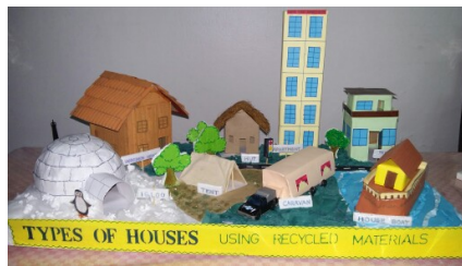
Types of houses