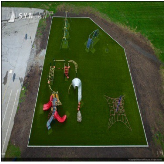
3) Play ground with artificial grass