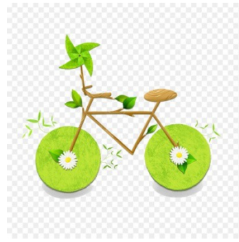
4) Go Green Bicycle